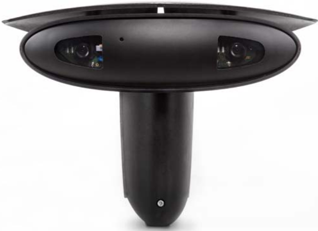
SafeWalk is an above-ground sensor for pedestrian detection.

SafeWalk integrates stereovision technology and intelligent detection for pedestrian presence detection at kerbsides.