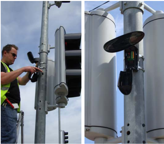
SafeWalk installation is quick and easy.