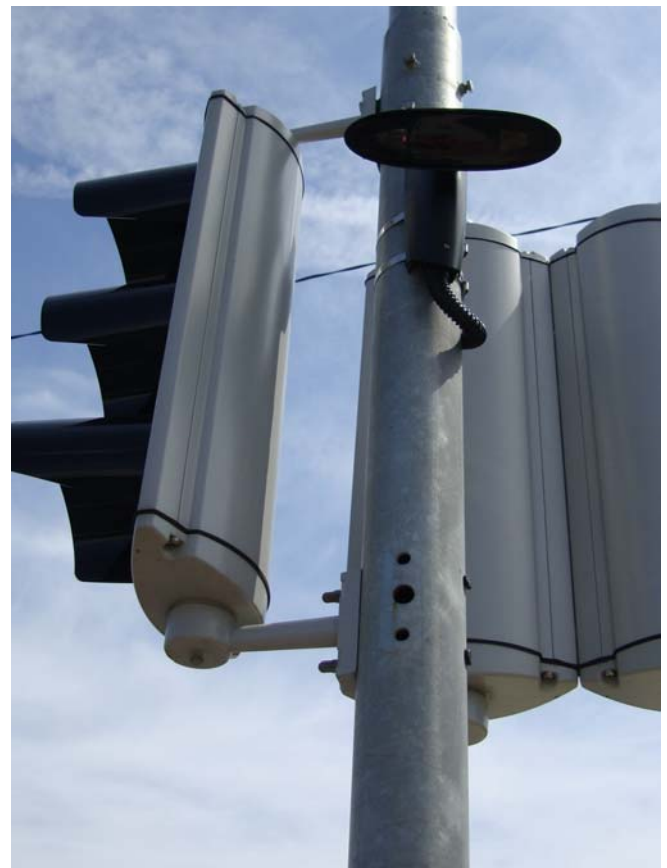
By monitoring the kerbside near zebra crossings, SafeWalk can increase safety and efficiency for both pedestrians and motorists.